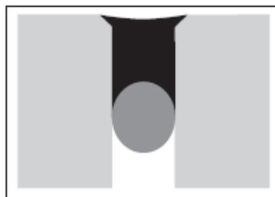
The flush joint design rules out trip hazards and dirt traps.

Backing: Use only closed cell, polyethylene foam backing rods.